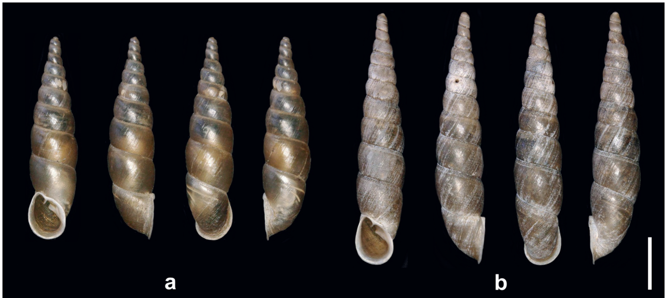
Figure 6 Phaedusa lucens Loosjes, 1953 (a), and Phaedusa filicostata (Stoliczka, 1873) (b), both from Malaysia, Pahang State, Bukit Charas near Kuantan. Scale bar: 5mm.

Recently it has been re-discovered by A. Hunyadi near the Dee Dote Waterfall in the Mandalay Region (21°42'33.8" N 96°21'16.9" E, 190m), a locality 100km north of the type locality. Only broken shells (body whorls and apices) could be found.