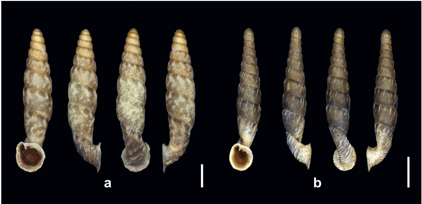
Figure 2 Indonemia excellens (Nordsieck, 2002), Myanmar, Taungoo to Demoso road at km 124.5 (a); Indonemia admirabilis sp. nov., holotype, NHMUK 20200185 (b). Scale bars: 5mm.