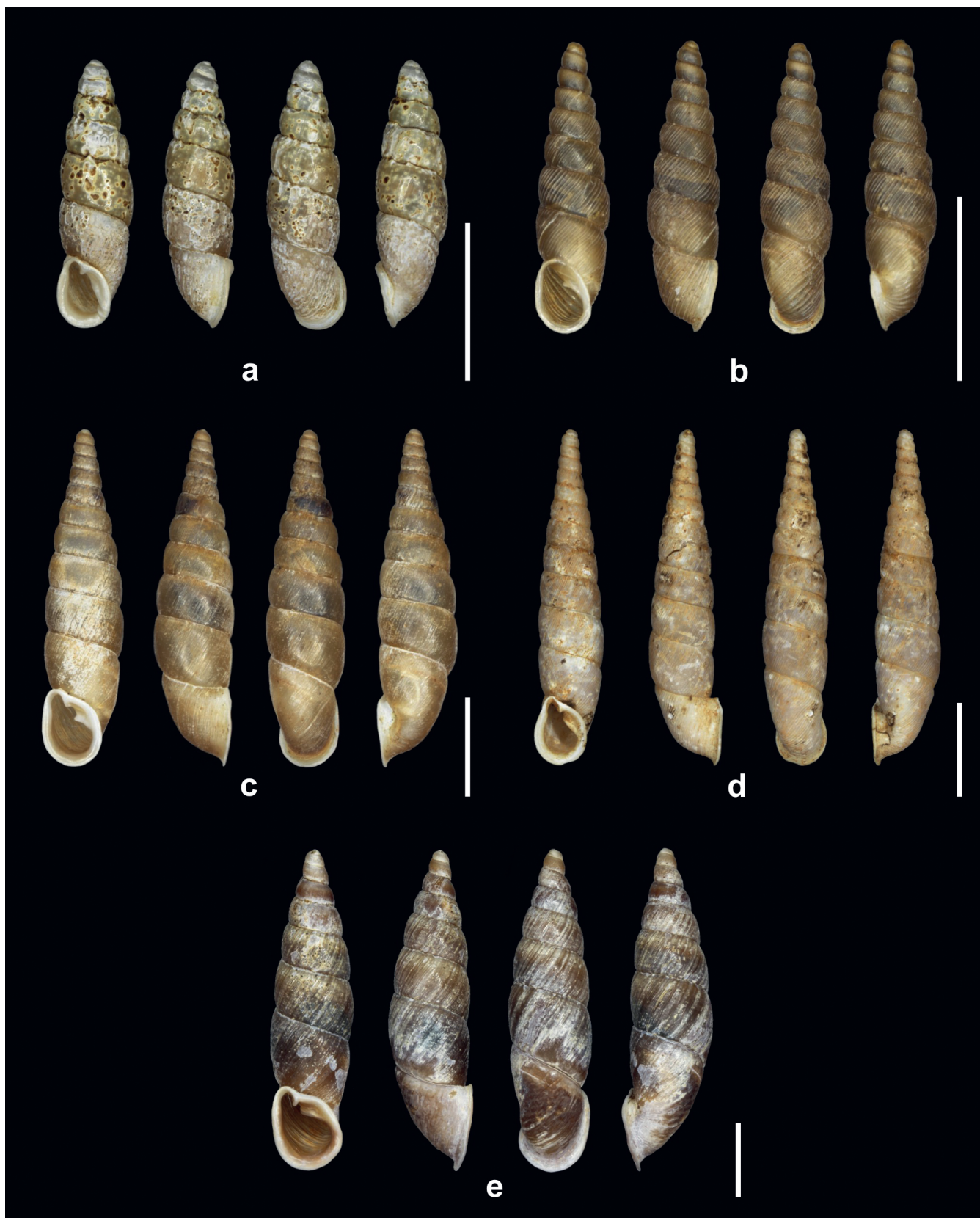
Figure 5 Margaritiphaedusa grata sp. nov., holotype, NHMUK 20200186 (a); Phaedusa kazueae sp. nov., holotype, NHMUK 20200187 (b); Phaedusa lypra (Mabille, 1887), Myanmar, Shan State, Nam Pam, War Lee Kwey Cave (c); Phaedusa theobaldi (Blanford, 1872), Myanmar, Kayah State, Maw Ti Do, Phruno River Cave (d); Phaedusa cocinchinensis (Pfeiffer, 1841), Vietnam, Da Nang, Son Tra Peninsula (e). Scale bars: 5mm.