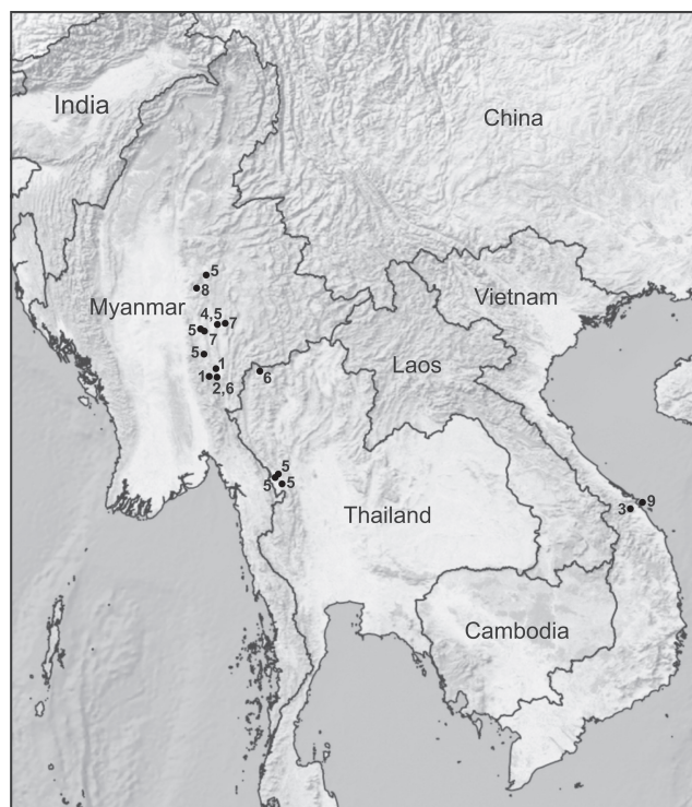
Figure 1 Map showing mentioned localities of Indonenia excellens (1), Indonenia admirabilis sp. nov. (2), Margaritiphaedusa grata sp. nov. (3), Phaedusa kazueae sp. nov. (4), Phaedusa lypra (5), Phaedusa theobaldi (6), Phaedusa burmanica (7), Phaedusa shanica (8), and Phaedusa cochinchinensis (9).

The studied material was collected by Jozef Grego during the 2019 expedition of the Myanmar Cave Documentation Project ( http://www.myanmarcaves.com/ ), as well as field trips by András Hunyadi, Kanji Okubo and Jamen Uiriamu Otani to Myanmar, Thailand and Vietnam during a period from 2009 to 2019. The